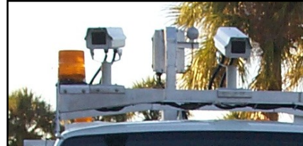
ROW and Forward Cameras