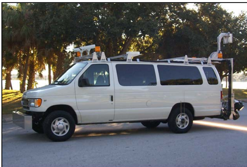
ICC Imaging Van with Forward and ROW Area Cameras and Downward Linescan with Lighting System

The subsystem is designed to mount inside a vehicle and withstand shock, vibrations and the environmental elements inside the vehicle while traveling up to 75 MPH. The subsystem operates from 115VAC requiring less than 300 Watts. The unit utilizes Pentium IV 1.7 GHz Computers with 512 MB of memory. The images are captured on a high-speed 24-bit color PCI imaging PCB and displayed on 15" active matrix flat panel display. The subsystem contains a fixed 80 GB hard disk for the Windows operating system and software plus two 80 GB removable hard disks for data storage. A 3.5" floppy disk, CD-ROM reader/writer, keyboard and mouse are provided for software loading and data preparation.